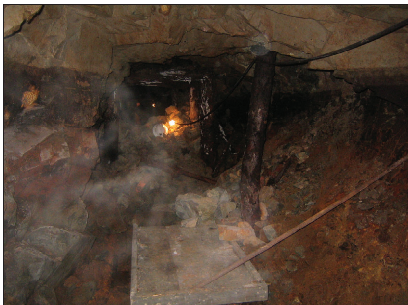
Special to the Daily Pictured is a photo sent in by tourist. Toward the upper left of the miner's helmet, there is possibly the misty outline of a head, then arms reaching out as if pushing a miner's cart.

Cindy started hearing unsettling things from their tour guides as well.